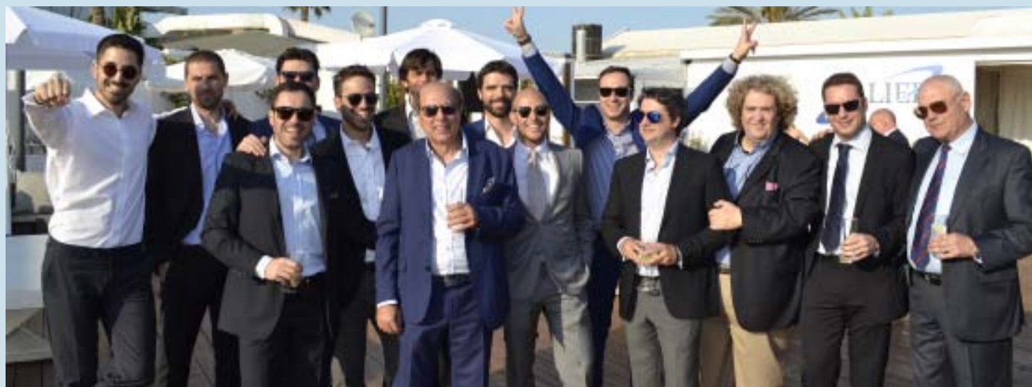
ALLIED SHIPBROKERS: Partners gather at the company's Posidonia party.