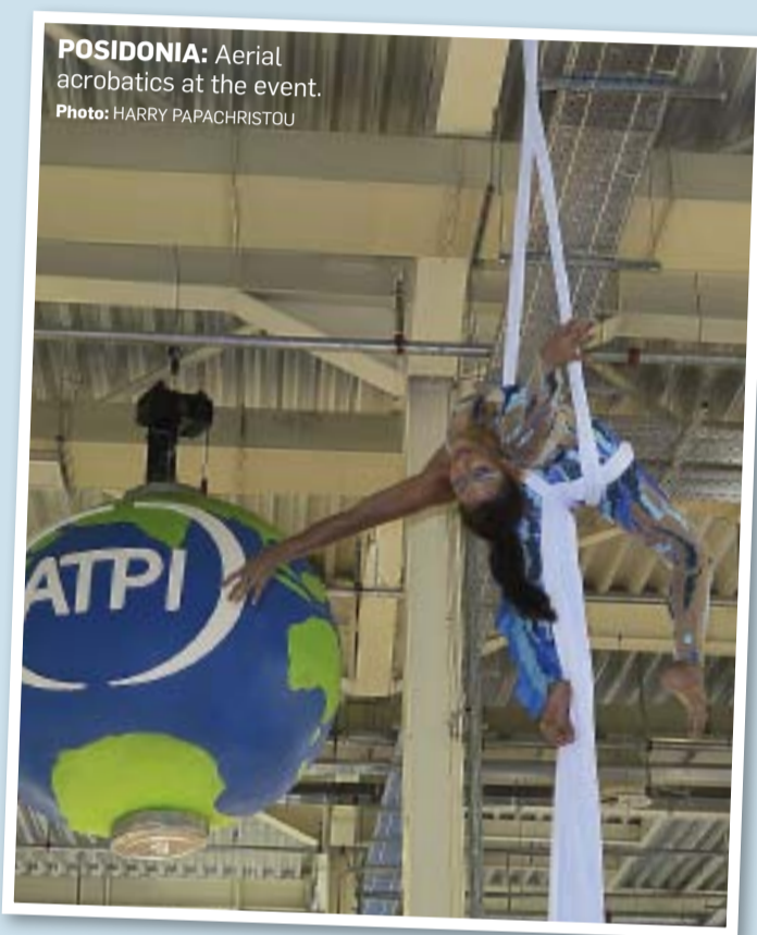
POSIDONIA: Aerial acrobatics at the event.